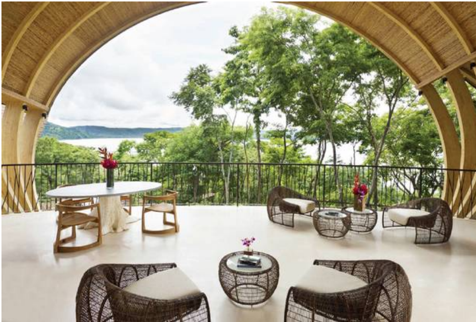
Paradise found: all rooms at the Andaz Peninsula Papagayo have ocean views

Costa Rica now has luxury to offer with the Andaz brand's first hotel in Latin America